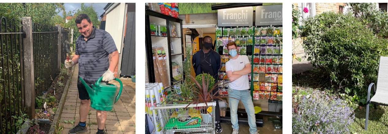
L&Q Living Inclusion